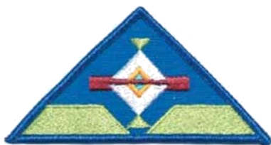
Path Finder Award 1st Year Discovery