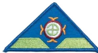
Navigator Award 3rd Year Discovery

4 Meeting Plans = 1 Project 4 Trail Beads = 1 Emblem