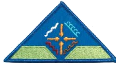
Trail Blazer Award 2nd Year Discovery